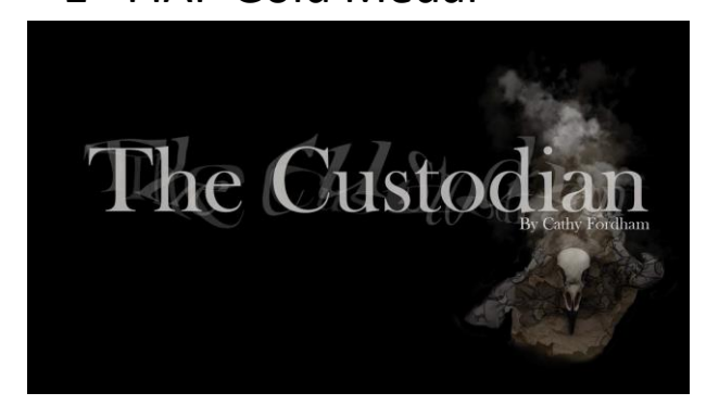
The Custodian Cathy Fordham (England)