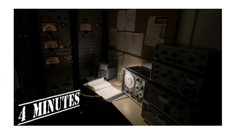
4 Minutes Howard Bagshaw (England)