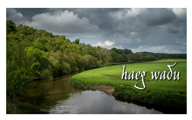
Haeg Wadu Howard Bagshaw (England)